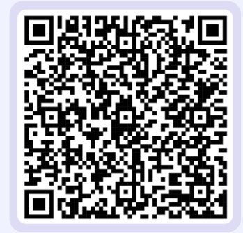
AESHA红雨伞性健康访谈